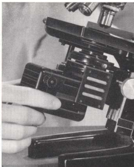
Figure 2 — Sliding the Opti-lume into the bracket.

Tilt the microscope at the inclination joint to a horizontal position. Remove the substage mirror and bracket assembly by pulling it straight outward away from the substage support. Slide the lower element of the substage condenser to its upper position. With a small screwdriver loosen the three set screws in the condenser tube immediately above the filter holder in bottom end of the tube. Turn the screws out equal distances, just far enough to permit removal of the filter holder.